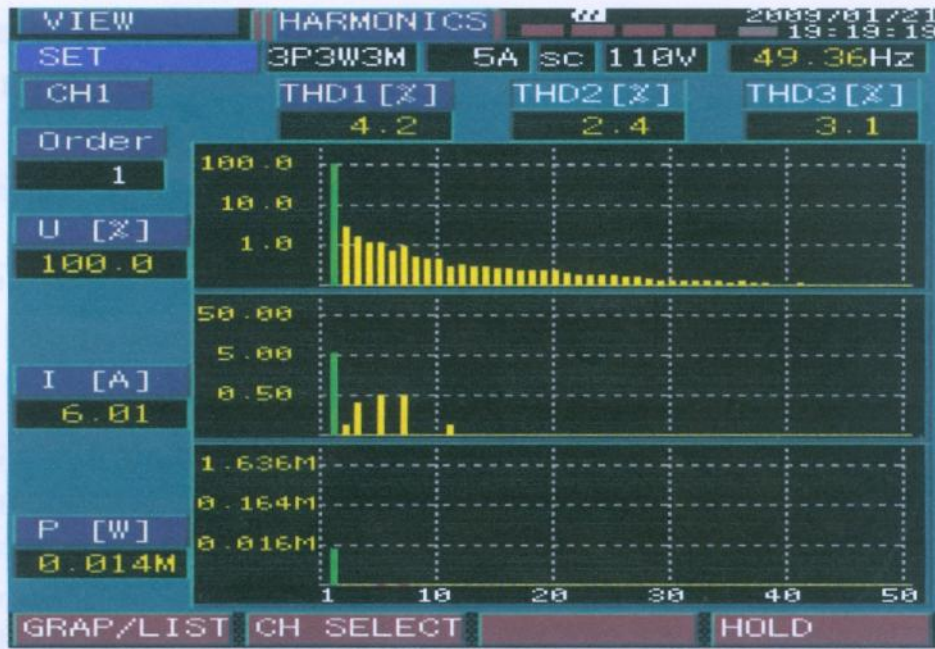
Fig. 14.2 THD (%) with Low Load Condition