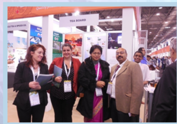
Glimpse of Tea Board pavilion