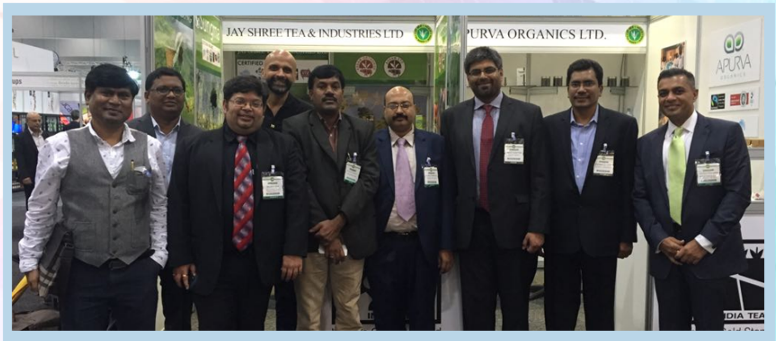
Tea Board's pavilion at the Fine Food Australia 2016

Tea Sampling of Indian Tea was organized through Australian Tea Masters thus attracting enquiries as well as visitors.