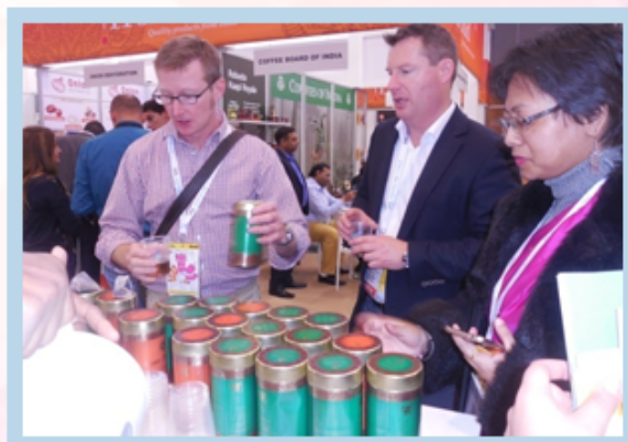
Overseas visitors at Tea Board pavilion