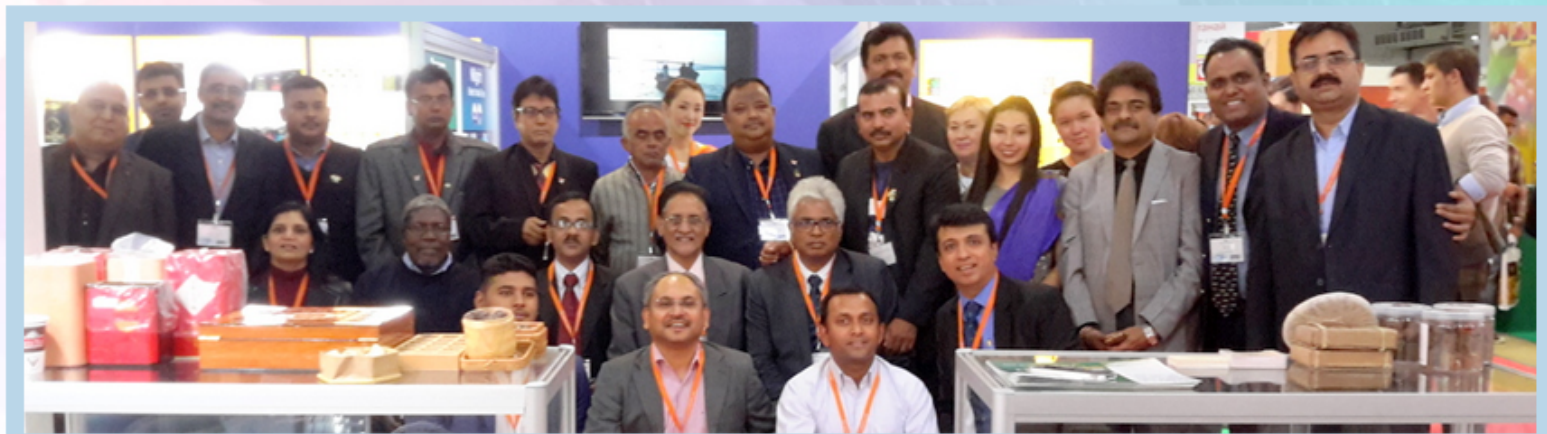
Tea Board participation at World Food Moscow 2016

The number of trade inquires was very encouraging. On the very first day the total footfall for some of the exporters was more than 100. Maximum trade inquires were for Assam followed by Darjeeling Tea. During the 4-day event the Tea Board's pavilion witnessed around 50 enquiries.