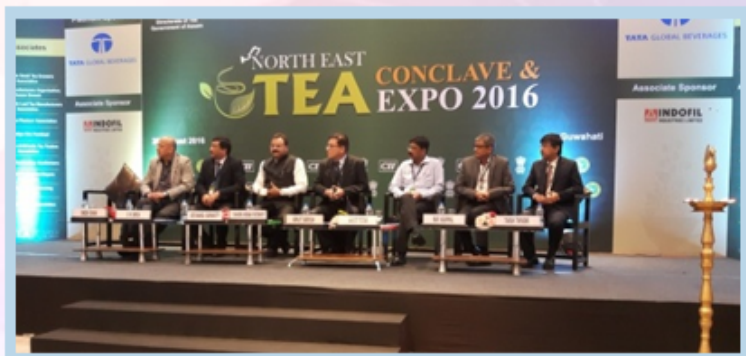
North East Tea Conclave & Expo 2016

In Assam, North East Tea Conclave was organized by CII with the support of Tea Board at Guwahati on 26-08-2016. Over 300 delegates comprising of all major buyers, producers and brokers participated. Hon'ble Industry Minister, Government of Assam was the Chief Guest for the programme.