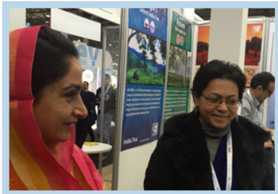
Hon'ble Minister visiting Tea Board Pavilion