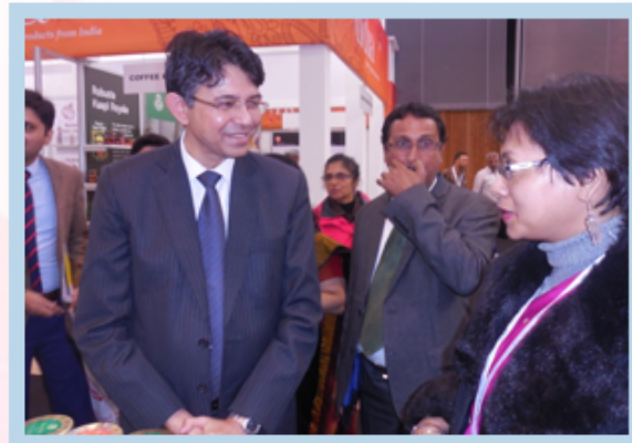
Deputy Chief of Mission Indian Embassy visiting Tea Board pavilion